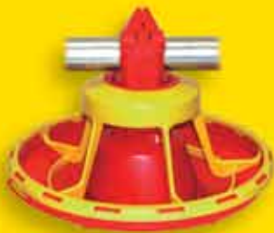
Gro-Pro Grill-less Feeder