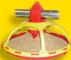
Gro-Pro 5-Star Feeder